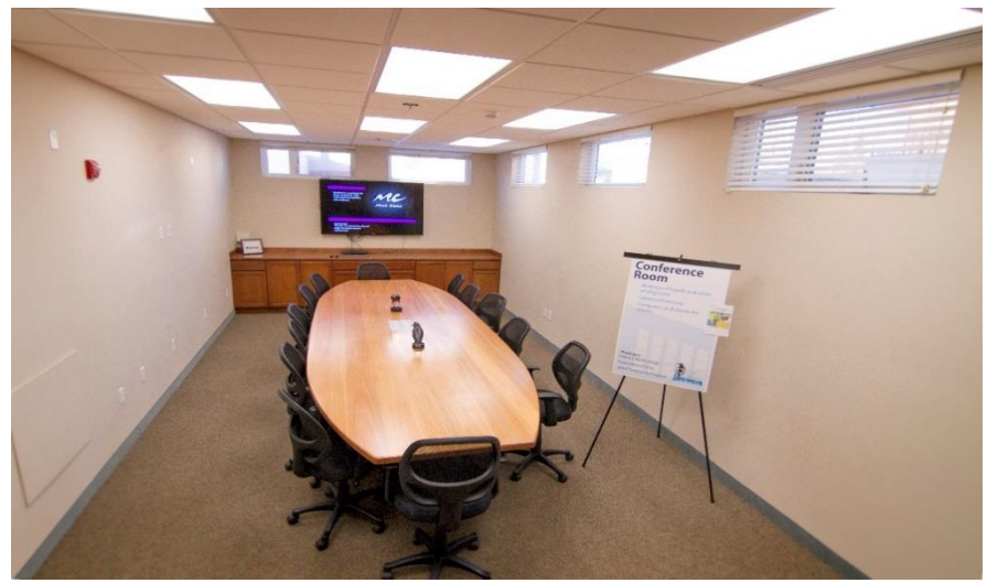
*Both of these rooms have portable sound systems available for use.

Our Conference Room can be utilized for meetings of any kind. The room boasts a beautiful custom conference table with table top connectors and a 70 inch HD television with web conferencing capabilities.